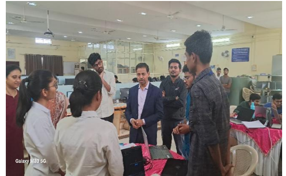
Dronix Round II

The 2 nd day of Wings round of Dronix am to 12:30 pm. The competed in Round II three winners were